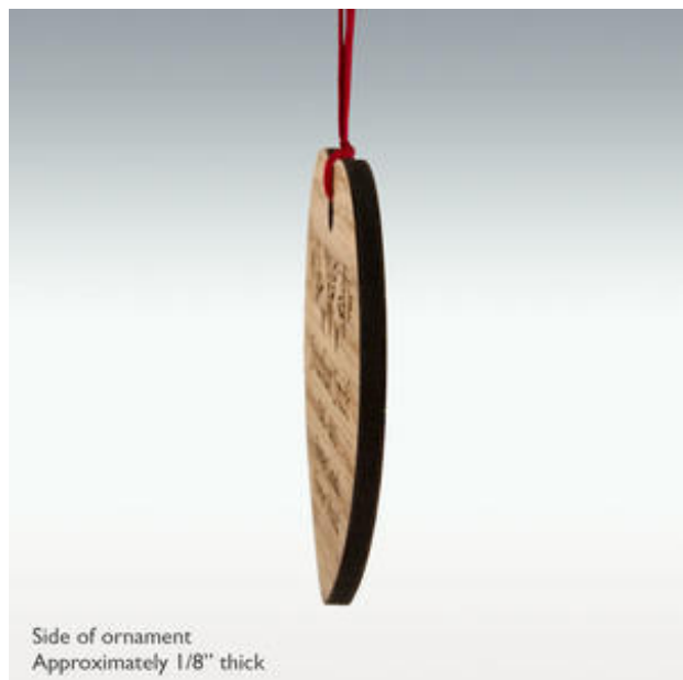
Side of ornament Approximately 1/8" thick