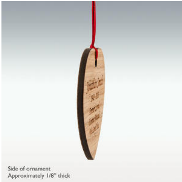
Side of ornament Approximately 1/8" thick