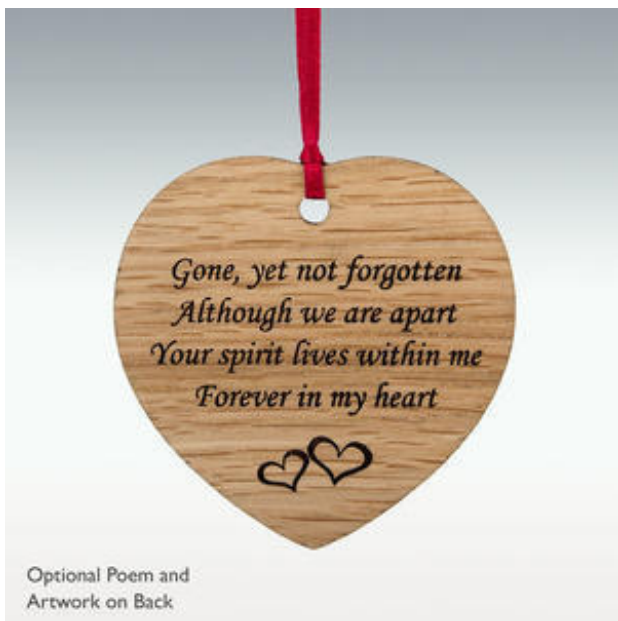
Optional Poem and Artwork on Back