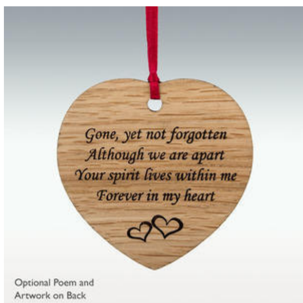
Optional Poem and Artwork on Back