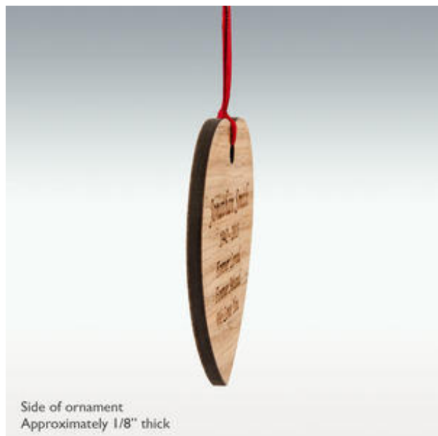
Side of ornament Approximately 1/8" thick